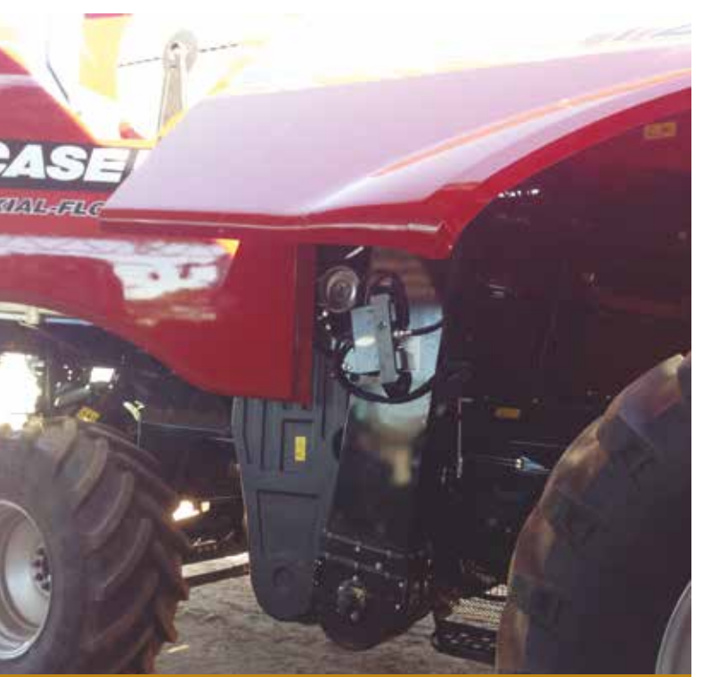
CropScan 3000H remote sampling head mounted to a Case combine.

Near infrared analysers have been used at bulk handling sites